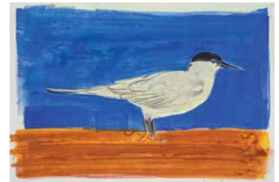
Kevin Garber, Roseate Tern , 13" x 20", watercolor