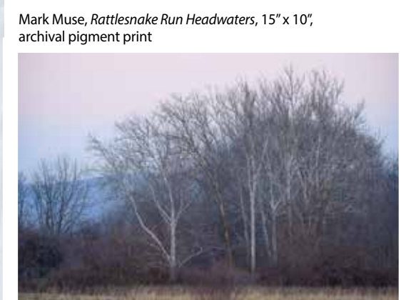
Mark Muse, Rattlesnake Run Headwaters , 15" x 10", archival pigment print