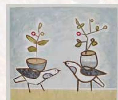
oil and collage on board, 26" x 29"