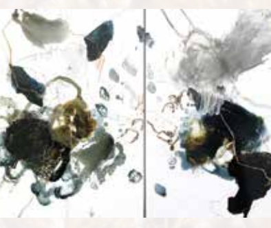
Alison Cooley, "Tidal 9220" (diptych), mixed media on panel, 40" x 60"