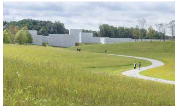
Approach to the Pavilions

Thursday, September 28, 8 a.m.–5 p.m. $95 members/$115 non-members, advance registration required Glenstone seamlessly integrates art, architecture, and landscape into a serene and contemplative environment with a mission of stewardship. Join us for a tour of the grounds and the new Environmental Center, lunch in the cafe, and an afternoon of exploring the grounds and galleries.