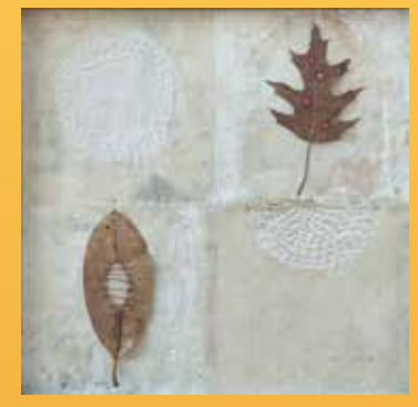
Bridgette Guerzon Mills, "Listening to Trees," encaustic, dried leaves, thread, and fabric, 16" x 16"