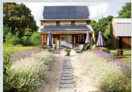
Calico Fields Lavender Farm

Tour the organic cutting garden of floral designer and longtime Arboretum docent Nancy Beatty , then create and take home a tiny tussie-mussie made of various types of greenery and mostly native plants.