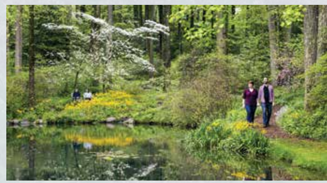
Mt. Cuba Center

Fee: $135 members/$170 non-members includes transportation, driver gratuity, and admission to the garden and the Burle Marx exhibit. Explore the NYBG gardens and grounds, including the contemporary designed Native Garden and Brazilian Modern: The Living Art of Roberto Burle Marx , a stunning large-scale horticultural tribute that explores the Brazilian modernist and his contributions to plant discovery, conservation, and garden design.