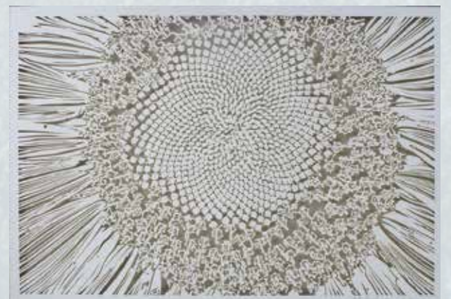
Blake M. Conroy, Sunflower , 14" x 21", laser-cut paper