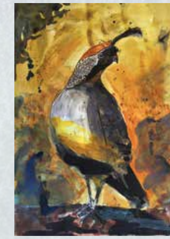
Kevin Garber, Gambel's Quail , watercolor, 13" x 19" (18" x 24" framed)