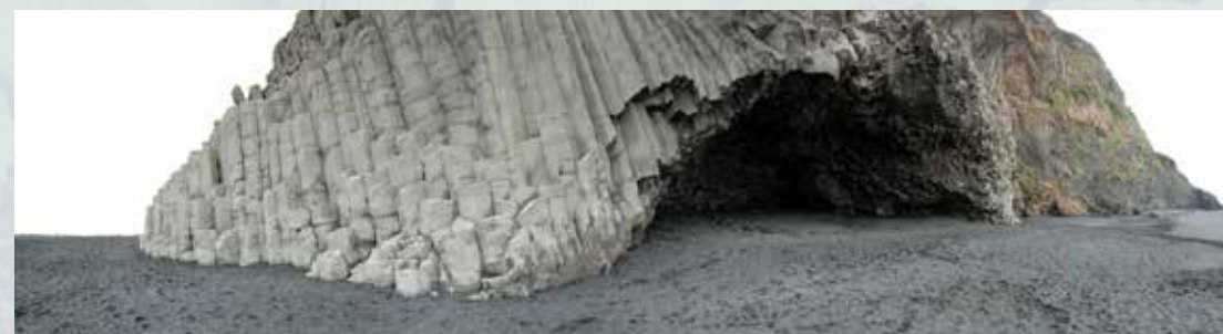
John Ruppert, "Sea Cave/The Iceland Project 2012–13," archival print, 10 3/4" x 40" (framed 19 3/4" x 49")

Plein air painter Julia Sutliff searches out natural landscapes wherever she can find them near her home north of Baltimore. Even in the sprawl of the city's suburbs, she discovers woods, ponds, streams, and fields and paints them onsite with fresh, energetic brushstrokes. In Four Seasons , on view August 2 through September 30, Sutliff presents paintings that celebrate the natural landscape throughout its seasonal cycles. Reception: Saturday, August 13, 3–5 p.m.