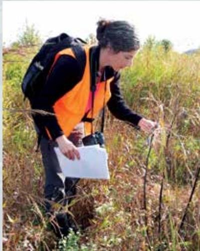
Native Plant Propagation Workshop, May 14