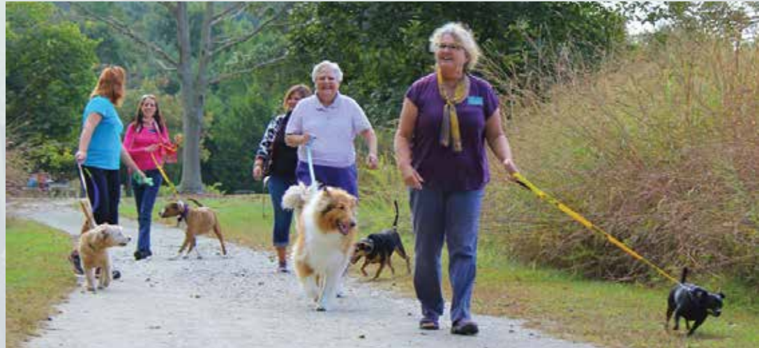
Dog Walking, Thursday mornings