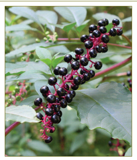
Phytolacca americana (fy-toh-LAK-ah amer-ih-KAN-ah) pokeweed—Long, drooping clusters of fruits ripen in late summer. Berries contain a vivid crimson juice. The plant may grow to be as tall as 9 feet, and the dark, purplish fruit clusters make it easily identifiable. Found along woods and meadow edges where sun aids the fruit ripening.