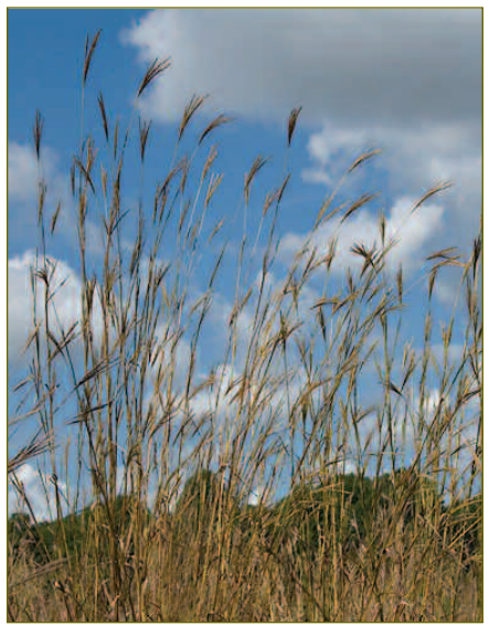
Andropogon gerardii (an-dro-PO-gon jer-AR-dee-eye) big bluestem—This clump forming grass gets its name from a bluish color at the base of the stem. Growing 4-6 feet tall, it's taller than other grasses in the South Meadow. Flowers arranged in 3 dense clusters explain the common name, "turkey foot grass".