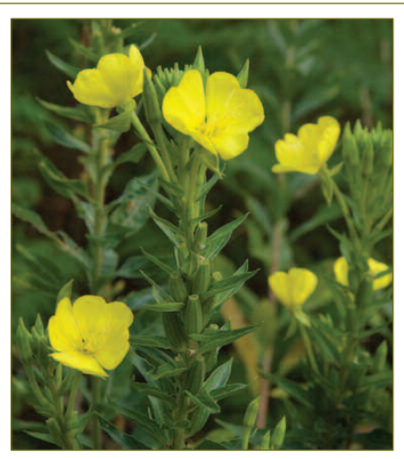
Oenothera biennis (ee-NOTH-er-ah by-EN-iss) common evening primrose— This entire plant can range from 1 to 6 feet in height with yellow 4-petaled flowers,1 to 2 inches in size, which open fully at twilight in meadows. Its leaves are broad and lance shaped with sparsely toothed edges. Fluted seed pods are beautiful in winter.