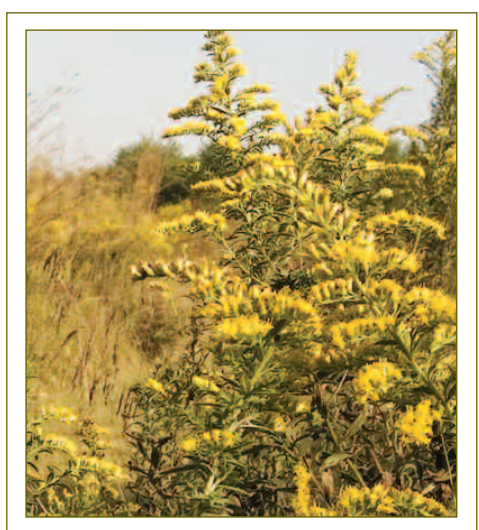
Solidago altissima (sol-ih-DAY-go all-TISim-ah) tall goldenrod—Plants grow 3 to 4 feet tall and form colonies in meadows, fields, and along roadsides. Flowers gather into small heads and spread sideways to form a brilliant yellow "feather" on top of the stem. Insects may cause a gall, or a swelling, to form along the stem from which they feed. This is one of the most common goldenrods.