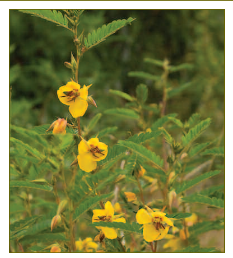
Chamaecrista fasciculata ( kam-ah-KRIST-ah fah-sik-yew-LA-ta) partridge pea—This pea plant relative's bright yellow flowers grow from the leaf axils yielding long, narrow seeded pods which ripen by late October, burst open and scatter. Fern-like leaves grow on branched, reddish stems. Seeds are valuable winter food for bobwhite quail. Found in the meadows and near the Children's Council ring.