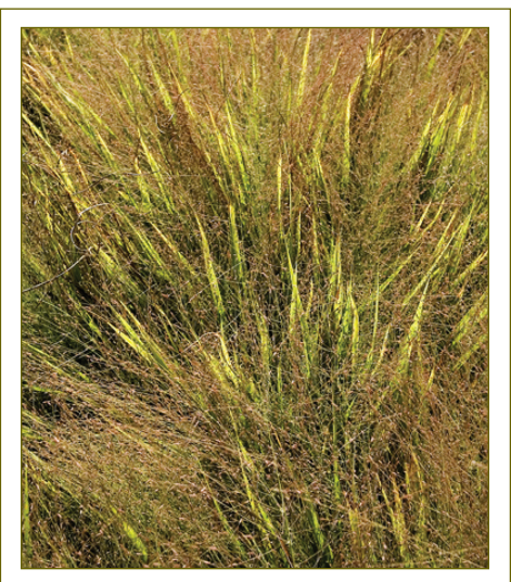
Eragrostis spectabilis (ehr-ah-GROS-tis spek-TAB-il-iss ) purple love grass— Found in the Arboretum's meadows and roadsides, it shows fluffy clouds of bronze red flowers in August and September. Short clumps of light green foliage in summer turn bronze red in fall. Very showy. Tolerates sandy soil and drought.