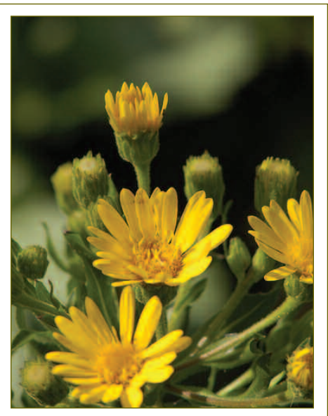
Chrysopsis mariana (kry-SOP-sis mar-ee-AHN-ah) Maryland golden aster— Notice loose clusters of single, goldenyellow flowers blooming late summer into fall in old fields, woodland edges, and along roadsides. Grows 1 – 2 feet and readily self-sows. Found along the Arboretum's upland path and in the meadows.