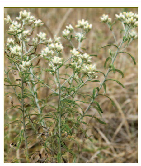
Gnaphalium obtusifolium (nah-FAHL-eeum ob-too-sih-FOHL-ee-um) pearly everlasting—This 1 to 3 foot plant has branching clusters of white flowers that bloom into the fall on white, wooly stems. Gray-green leaves are fragrant when crushed. Used medicinally by Native Americans, it is also used in aromatic flower arrangements. Prefers dry sunny areas like the North Meadow.