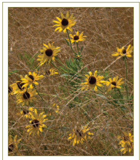
Rudbeckia hirta (rud-BEK-ee-ah HER-ta) black-eyed Susan—This familiar plant is a member of the huge aster family, and is known by its typical daisy like flower head on an erect, bristly stem. It may grow as tall as 3 feet, and flowers produce from summer until mid autumn in fields, meadows, along garden borders and roadsides. It is the state flower of Maryland.