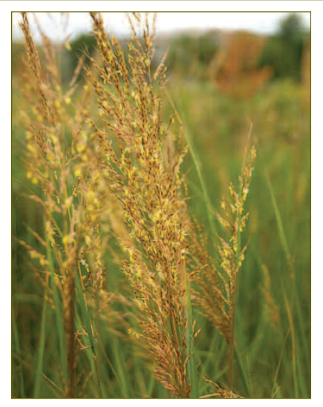
Sorghastrum nutans (sor-GAS-trum NEW-tanz) Indian grass—Look for the silky and soft, golden brown seed plumes of this plant in the autumn landscape. It may reach a height of 3 to 5 feet, the second most important tall grass next to Big Bluestem. It grows rapidly in well-drained soil. Found in the south meadow.