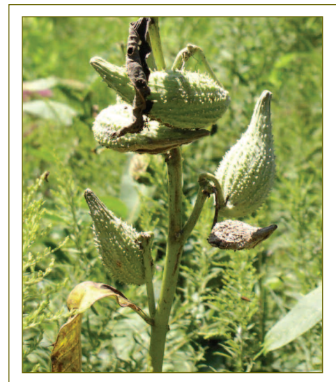
Asclepias syriaca (ah-SKLEE-pee-us seeree-AH-kah) common milkweed— Easily identifiable in summer by fragrant pink pompoms of blossoms which are a nectar source for many butterflies. Leaves are also food for monarch butterfly larvae. In fall, seeds bearing white hairs emerge from warty pods and float everywhere. Commonly found in the Arboretum's meadows.